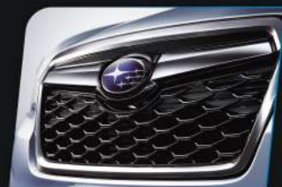
Chrome Front Grille (For Premium Grade) HK$6210.00 J1010S,J100

This easy-to-install body side molding is designed to protect the Forester from shopping carts, door dings, scratches and other road hazards. The colours are matched precisely for added style.