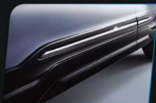
Body Side Molding (4 Pcs) HK$9072.00 J1017S,J150

It provides good air circulation and keeps the rain out when driving with the windows down.