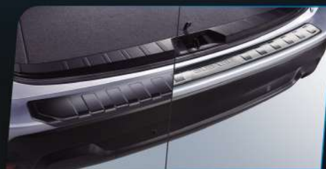
Cargo Step Panel

Heavy duty tray mat protects carpet from mud and water roof.