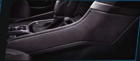
Console Side Panel (2 Pcs) J1310SJD10

Elevate the overall look and feel of the car's interior with a light bronze color for elegance and class.