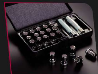
STI Security Wheel Nut Set HK$4098.00 ST28170ST060

These wheel valve caps are lightweight with a knurled finish design on machined aluminium to prevent slippage. A silver alumite treatment has been applied to the surfaces of these valve caps to improve its resistance to weather and match the color of the aluminium wheels. The hexagonal heads of the valve caps have rounded tops, and a cherry red STI logo is stamped on the embossed area.