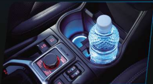
Drink Holder Illumination H2010SJD00

This car interior decorative light creates a clear atmosphere. Scratch resistant, durable, and very stable.