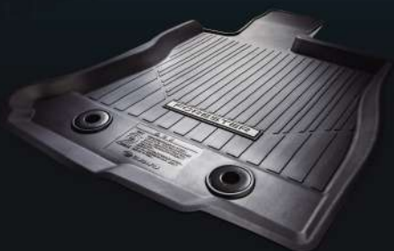
Tray Mat (5 Pcs) HK$3061.00 J5017S,J100

This helps protect your paint finish from rocks and other road debris.