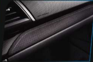
Instrumentation Panel J1310SJD90

This elegant stainless steel sill plate with the Subaru logo protects the area from scratches and damage.