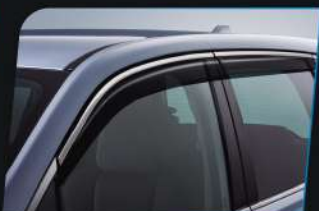
Door Visor With Chrome Molding (4 Pcs) HK$2327.00 F0010S,J010

It provides good air circulation and keeps the rain out when driving with the windows down.