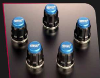
STI Wheel Nut Blue Set (20 Pcs) HK$2374.00 ST28170ST000