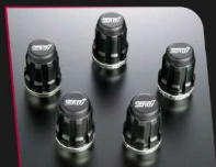
STI Wheel Nut Black Set (20 Pcs) HK$2374.00 ST28170ST020

Set of 16 lug nuts and 4 lock nuts. Enhanced security with a reliable locking mechanism, 3-layer nickel plated hard steel, with chrome finish to prevent rust. Special tool included (McGuard). Measures 12 x 1.25mm