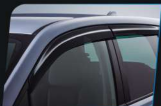
Door Visor Without Chrome Molding (4 Pcs) HK$1490.00 F0010S,J000

These visors are durable, crack-resistant and designed for an unobstructed view of the side mirrors. Its smooth and tapered design is integrated with the external lines of the vehicle for a bold look.