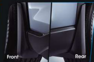
Splash Guard (2 Pcs) HK$578.00 J1010S,J001 HK$702.00 J1010S,J004

This offers added protection to the lower bumper area while giving it a stylish, rugged accent.