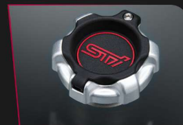
STI Engine Oil Filler Cap HK$1202.00 ST15257Z0010

*Compatible with batteries with "D" as the third digit