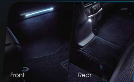
Footwell Illumination Kit (Front & Rear) H7010SJD00

Customise your Forester's interior with a footwell illumination kit. This lighting kit from Subaru casts a soft, crisp, blue glow into the front footwells. Makes a lasting first impression with your passengers.