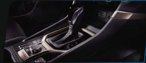
Light Bronze Front Cover J1310SJD11 & J1310SJD10

Engineered at a comfortable height, this arm rest has extra padding and made of durable material for comfort during long drives.