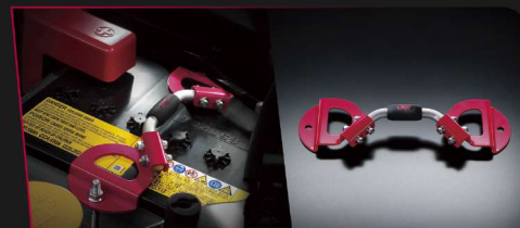
STI Battery Tower Bar HK$1202.00 ST62182ST000

A unique battery holder reminiscent of the flexible tower bar, adds an attractive highlight to the engine compartment, in addition to securely holding the bulky battery.