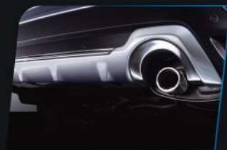
Rear Bumper Under Guard (Bumper Panel) HK$8981.00 E5510S,J000

Without proper air flowing into the engine compartment, a car is at risk of overheating. The chrome front grille plays an important role in cooling the vehicle's engine. It also lends a distinctive style to the vehicle.