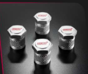
STI Valve Cap Set (4 Pcs) HK$533.00 ST28102ST030

These wheel valve caps are lightweight with a knurled finish design on machined aluminium to prevent slippage. A silver alumite treatment has been applied to the surfaces of these valve caps to improve its resistance to weather and match the color of the aluminium wheels. The hexagonal heads of the valve caps have rounded tops, and a cherry red STI logo is stamped on the embossed area.