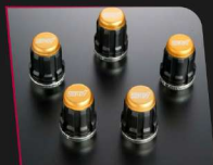
STI Wheel Nut Gold Set (20 Pcs) HK$2374.00 ST28170ST010

Narrow lug nut set with 3-piece structure. This product has a 3-layer coating, dichromate finishing to protect against corrosion on tapered areas. Its caps have a clear-coated, laser-engraved STI logo. The theft prevention lock nut can only be installed/removed with a special tool.