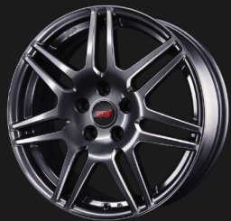
STI Alloy Wheel 18" (Gunmetal) (4 Pcs) HK$22144.00 B3110S.J010