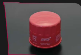
Performance Oil Filter HK$406.00 ST15208ST010

This is an oil filter with enhanced performance thanks to an increased filtration area of 15% compared to conventional filters. With dedicated materials to improve its particle collection performance, this filter also captures fine particles such as carbon and reduces pressure loss by 10%. It is compatible with high viscosity oil, providing a stable performance not only on roads but also on the circuit track.