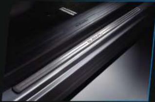
Side Sill Plate (2 Pcs) E1017SJD10

This elegant stainless steel sill plate with the Subaru logo protects the area from scratches and damage.