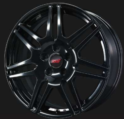
STI Alloy Wheel 18" (Black) (4 Pcs) HK$22144.00 B3110S.J020