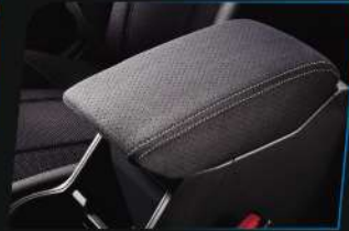
Arm Rest J1310SJD20

Protects the dashboard while giving a sporty look to the interior of the car.