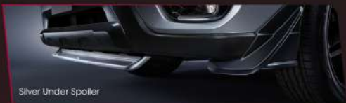
Silver Under Spoiler

This spoiler rectifies the flow of air into both front sides of the vehicle as well as improves driving stability. It also controls the flow of air and prevents it from lifting the vehicle by diverting it towards the rear.