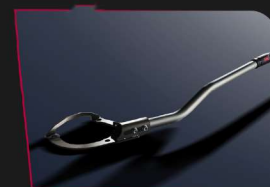
STI Flexible Tower Bar HK$4720.00 E4010FL000

This is an oil filter with enhanced performance thanks to an increased filtration area of 15% compared to conventional filters. With dedicated materials to improve its particle collection performance, this filter also captures fine particles such as carbon and reduces pressure loss by 10%. It is compatible with high viscosity oil, providing a stable performance not only on roads but also on the circuit track.