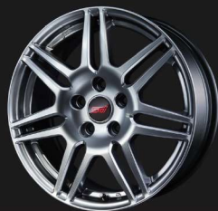
STI Alloy Wheel 17" (Gunmetal/Black/Silver) (4 Pcs) HK$18968.00 B3110S.J100/110/120

These cast aluminium wheels are made using the spinning production process to form the shape of the rims. This ensures a reduced weight with increased rigidity. This design perfectly matches the new Forester body design and its colours.